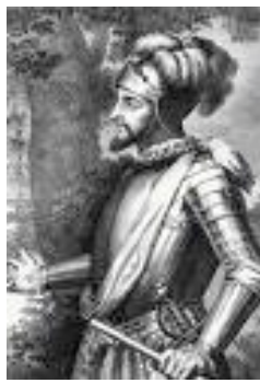
Vasco Núñez de Balboa