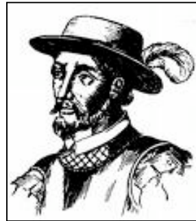
Juan Ponce de León